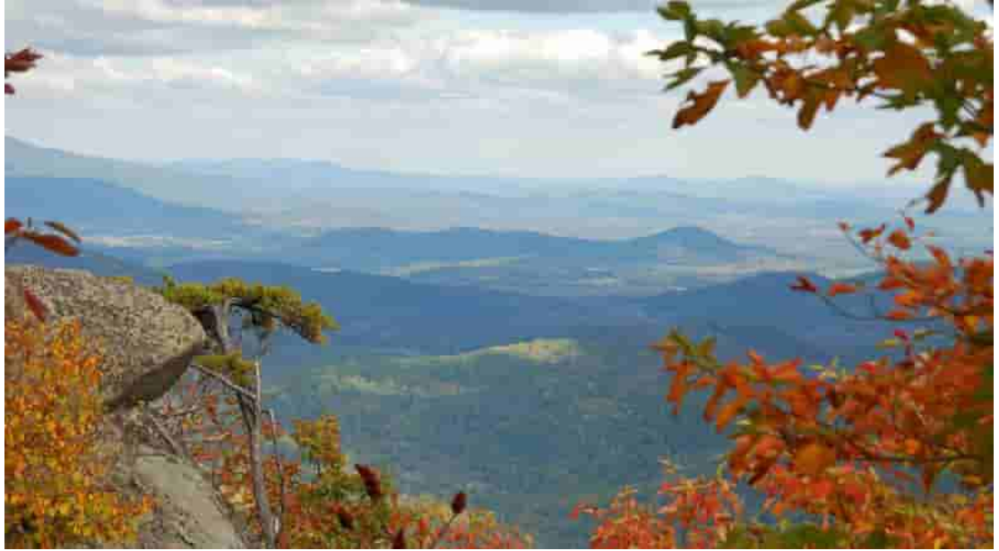
Figure 1. An example image.